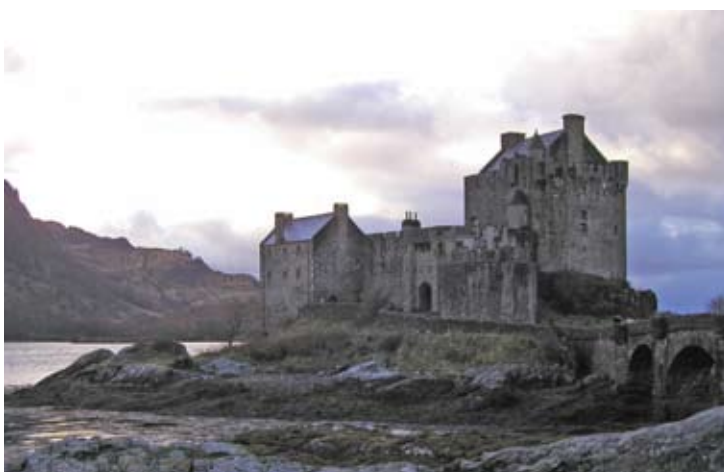
Fixed using this INCREDIBLY simple method